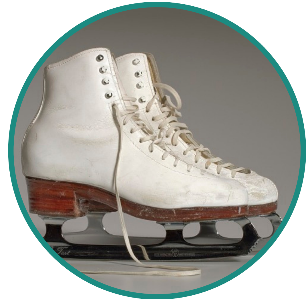
PAIR OF WHITE FIGURE SKATES WORN BY DEBI THOMAS

In what ways have you been a trailblazer, or what way(s) do you want to be a trailblazer in your life?