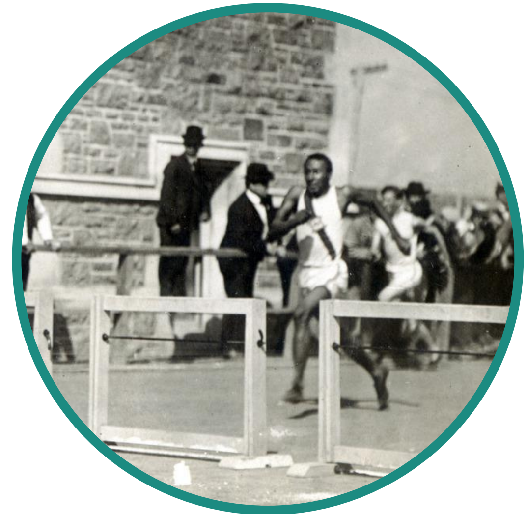
FINISH OF THE 200 METER HURDLE RACE AT THE 1904 OLYMPICS...GEORGE POAGE, MILWAUKEE ATHLETIC CLUB, THIRD.

How did living during the early-twentieth century for George Poage, and the late-twentieth century for Debi Thomas impact their Olympic debuts?