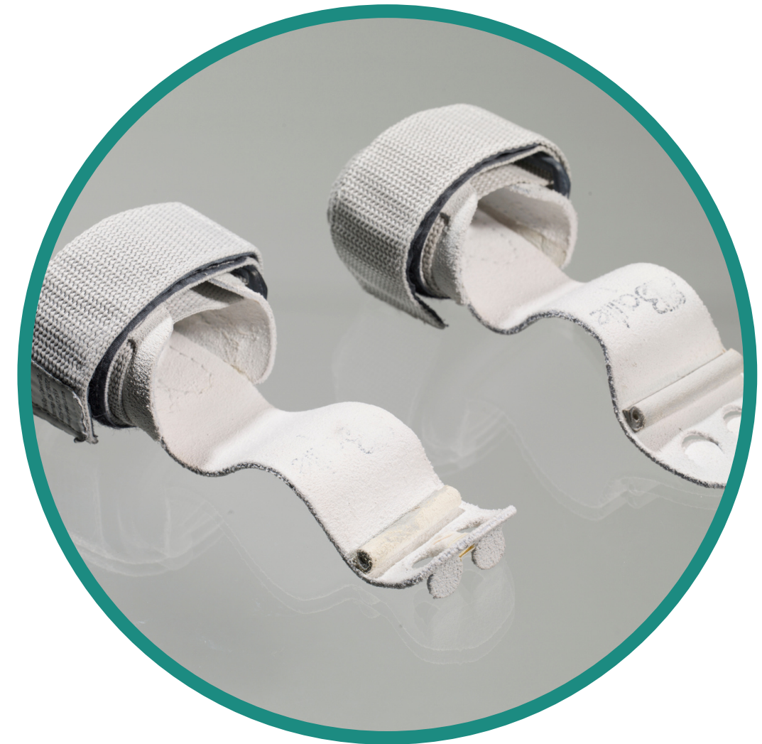
UNEVEN BAR GRIPS USED BY GABBY DOUGLAS IN THE 2012 LONDON OLYMPICS

If you received a gold medal for a talent or skill, what would it be for? (This skill or talent does not have to be a sport. It can be anything!)