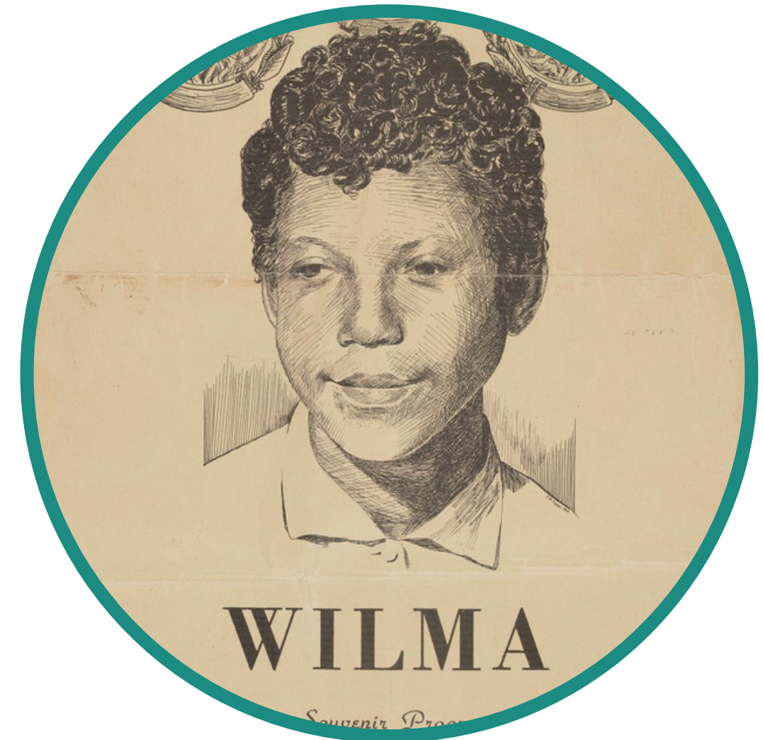
SOUVENIR PROGRAM FOR WILMA RUDOLPH DAY

After reading about Gabby Douglas and Wilma Rudolph, what do you believe are two or three characteristics that makes a gold-winning Olympian?