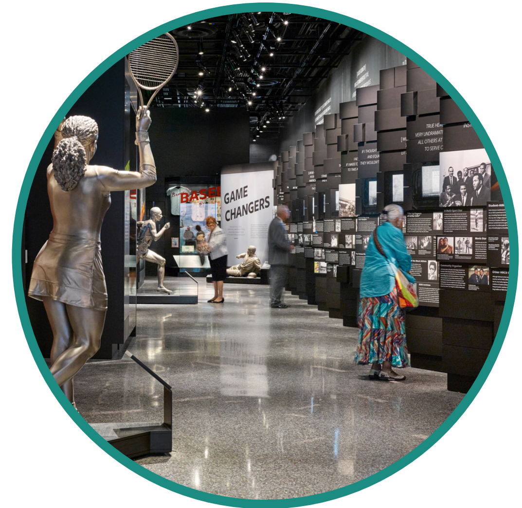
NMAAHC GALLERY: SPORTS: LEVELING THE PLAYING FIELD

So instead of working out today, let's focus on historical thinking!