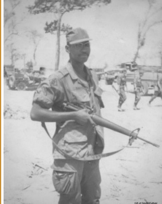
Gift of Devin Culver