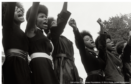
Gift of the P.O. Jones Foundation, © 2011 Pirkle Jones Foundation

NATIONAL MUSEUM of AFRICAN AMERICAN HISTORY & CULTURE